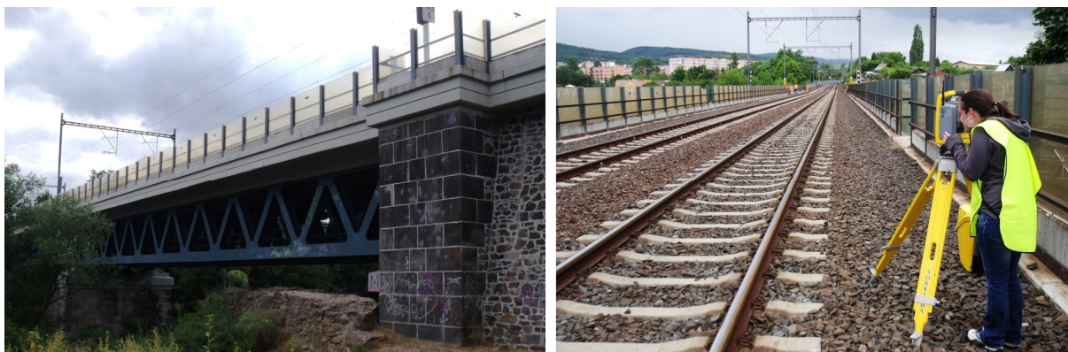
Figure 3 Railway bridge in Klášterec nad Ohří