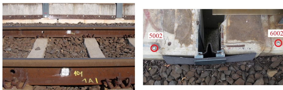
Figure 2 Stabilization of points