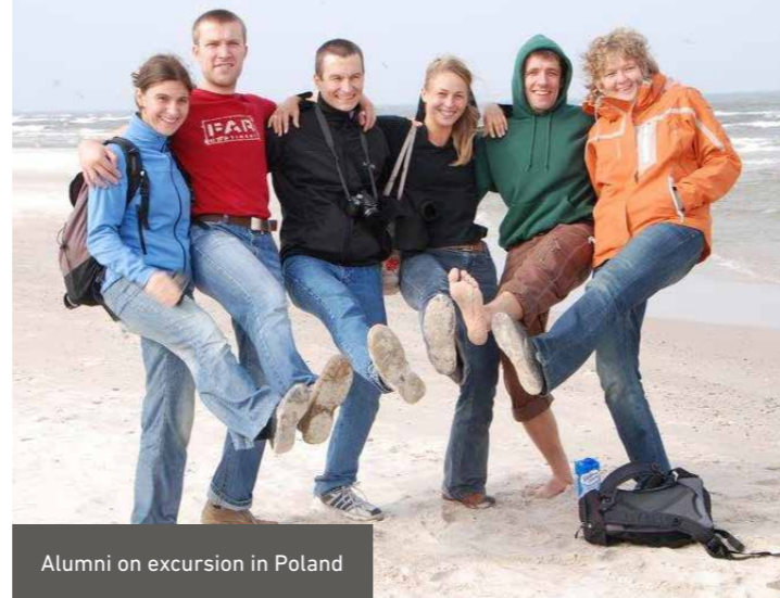
Alumni on excursion in Poland

During the fellowship practical solutions for current environmental issues are developed. After their stay in Germany the alumni are well qualified to tackle these issues in their home countries thus assuring efficient knowledge transfer. Working closely together in an international context helps to breakdown existing barriers. The acquired contacts will create a strong network of highly committed environmental experts.