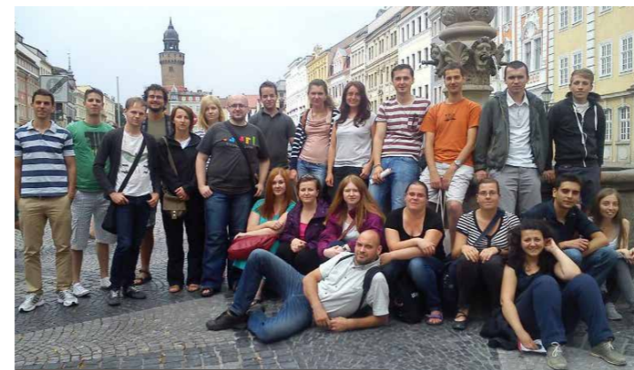
Fellowship recipients during a city tour