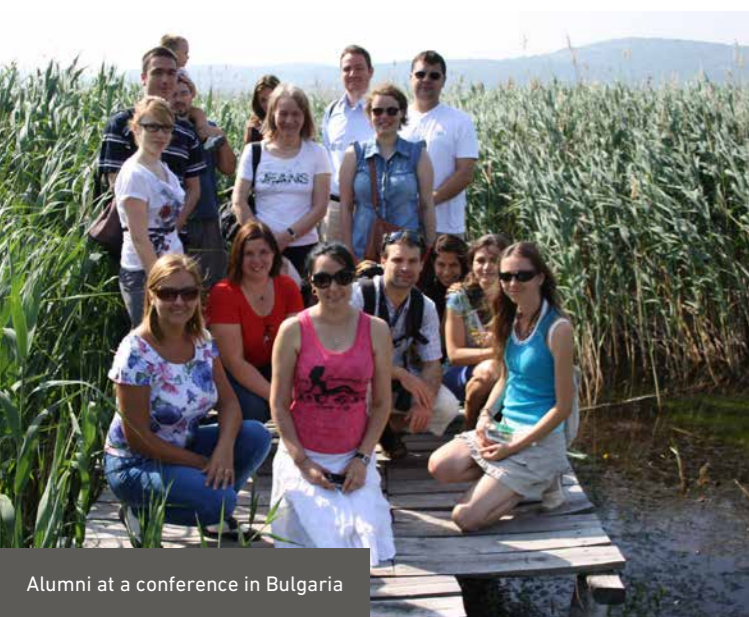
Alumni at a conference in Bulgaria

DBU coaches its fellows during the whole stay. During seminars the fellowship recipients can present their topics and their results and network with each other. Furthermore, DBU welcomes and supports individual initiatives to organize further professional events and seminars.