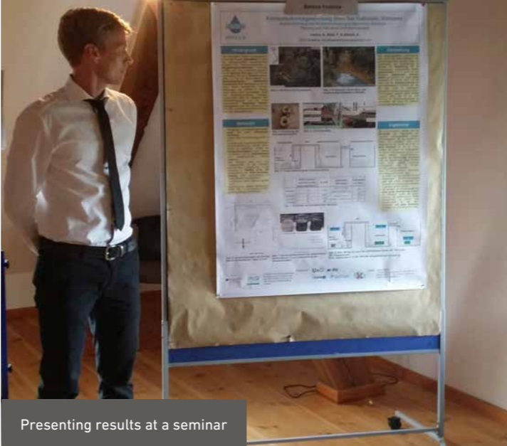
Presenting results at a seminar

No work permit is needed for the fellowship stay in Germany. For the right of entry into Germany, however, some states require a visa. Fellowship recipients must apply for visa themselves in their native countries.