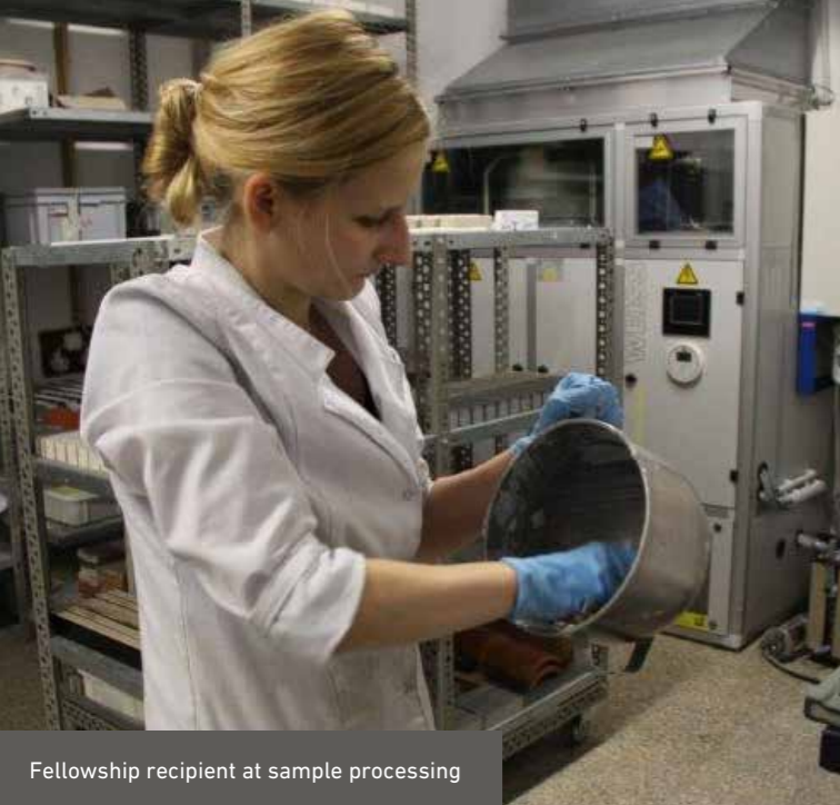
Fellowship recipient at sample processing