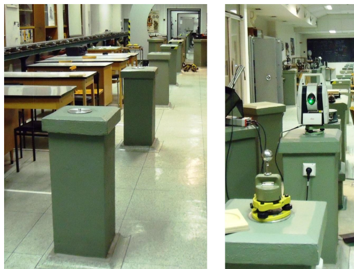
Figure 2 Photographs of the baseline