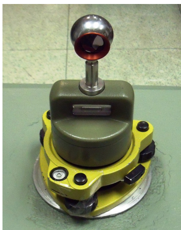
Figure 5 Target Set - Tribrach Topcon, Leica carrier GZR3, Leica prism RRR1.5