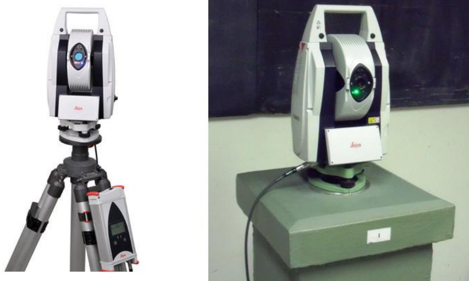
Figure 4 Leica Absolute Tracker AT401

Leica Absolute Tracker AT401 (Fig. 4) and two specially selected tribrachs of Topcon, one carrier Leica GZR3 with optical plummet and one spherical prism Leica RRR1.5 in (Fig. 5) were used for determination of the size of the baseline. The Leica Absolute Tracker AT401 is primarily designed for high-precision engineering measurements. The measurement accuracy is characterized by standard deviations \sigma_{\varphi} = \sigma_z = 0.15 mgon for horizontal directions and zenith angles and \sigma_D = 5 \mu\text{m} for distances. The maximum range of the distance measurement is 160 m. For the purpose of experimental measurements the Absolute Tracker has been borrowed from the Research Institute of Geodesy, Topography and Cartography of Czech Republic (VÚGTK).